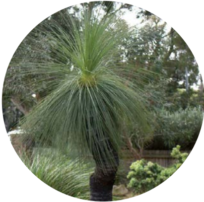
Xanthorrhoea Sp Grass Tree