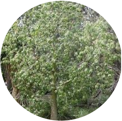
Backhousia myrtifolia Cinnamon Myrtle