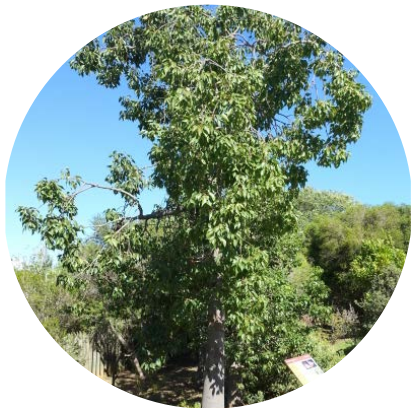
Brachychiton populneus Kurrajong