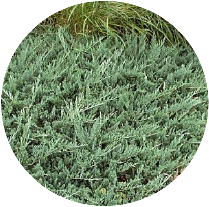
Juniperus horizontalis ‘Douglasii’