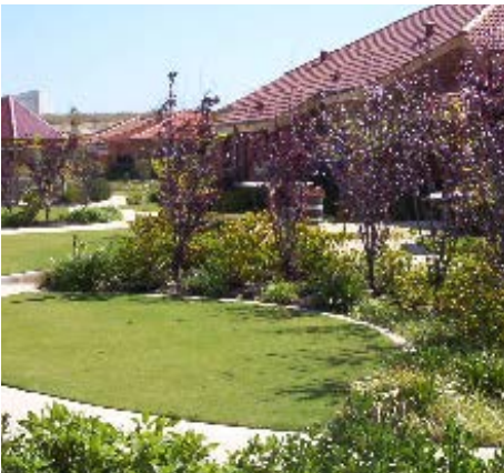
Turf garden area