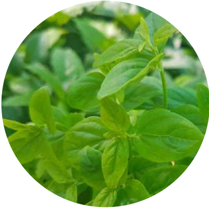
Mentha australis Native Mint