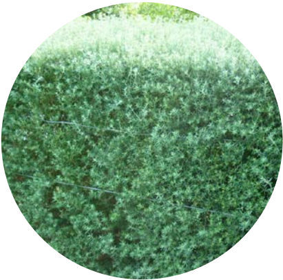
Westringa ‘Wingecarribee Gem’