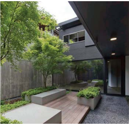
Gravel planter area