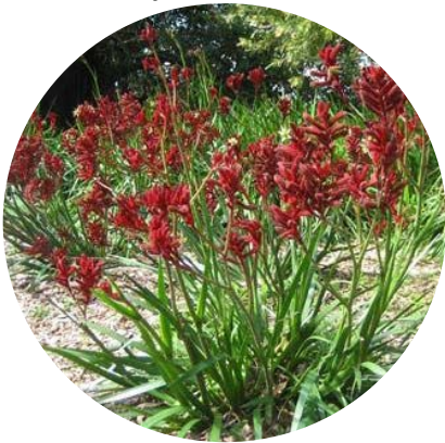
Anigozanthos Big Red Kangaroo Paw