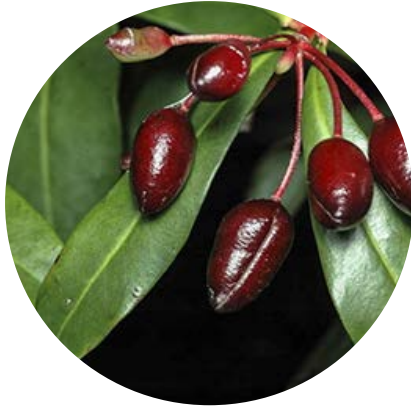
Tasmania insipida Pepper Bush