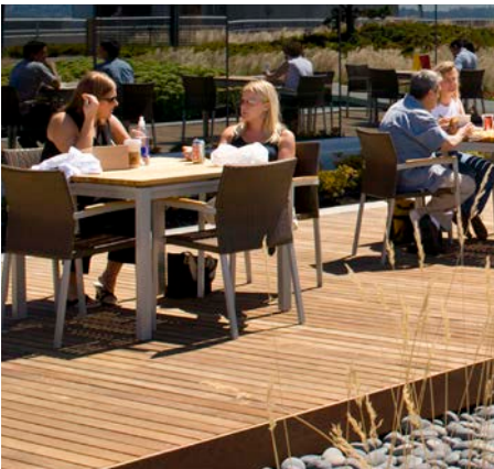
Deck area with planting