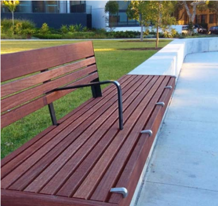
Lawn seating opportunities