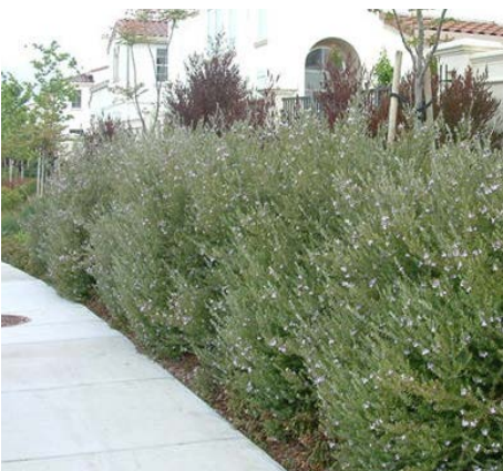
Screening planting to services